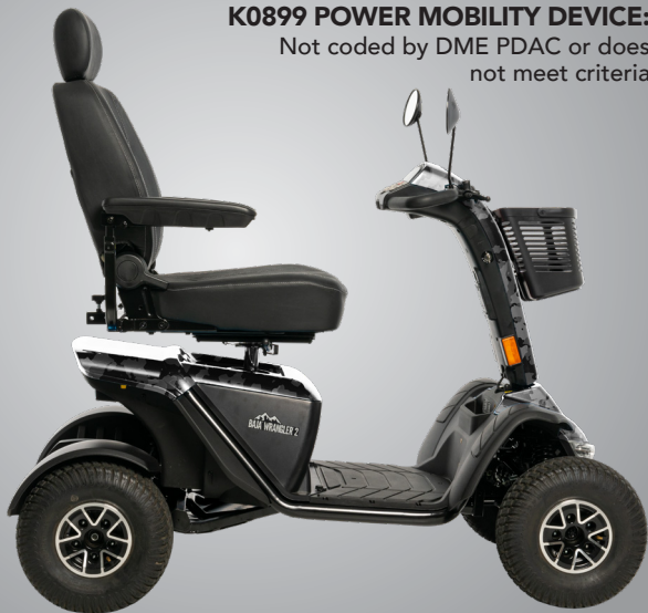
FDA Class II Medical Device**

Not coded by DME PDAC or does not meet criteria