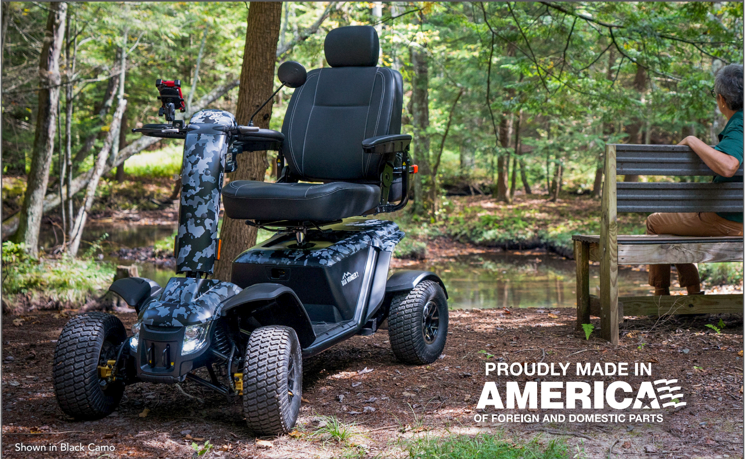
Shown in Black Camo

PROUDLY MADE IN AMERICA OF FOREIGN AND DOMESTIC PARTS