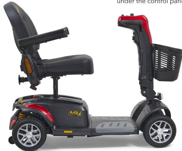
5. A stylish new profile offers ample leg room!