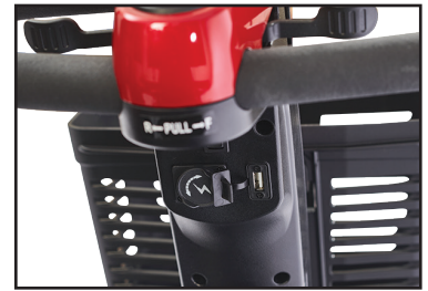
4. USB & Battery Charging Ports conveniently located on the tiller under the control panel.