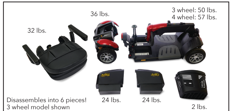
Disassembles into 6 pieces! 3 wheel model shown