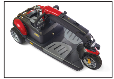
2. The tiller folds easily and locks in place.