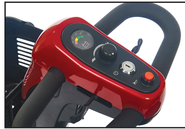
1. An Infinite Adjustable Tiller (no knuckle) at your fingertips!

Literature is current at time of printing. Golden Technologies reserves the right to make changes to the product or literature at any time.